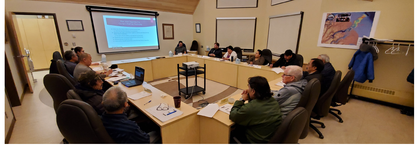
Municipality of Clyde River, Nunavut